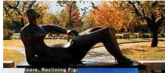
Moore, Reclining Figure